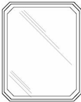
Clear Glass Tops