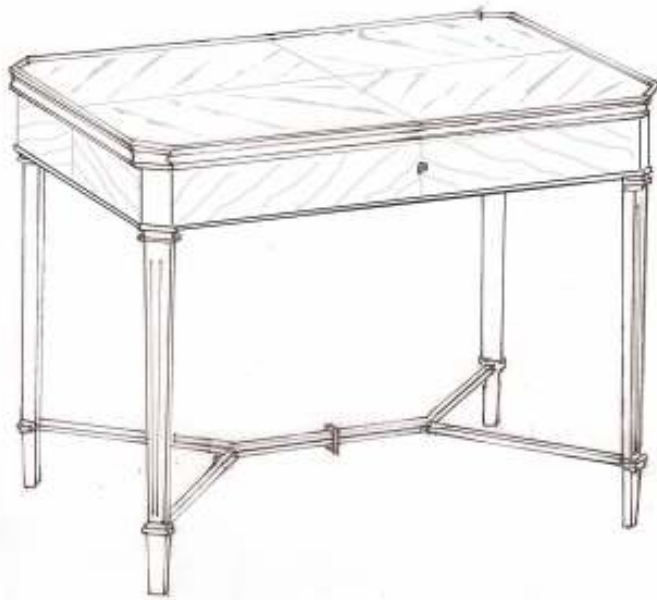
Custom Lucido Side Table